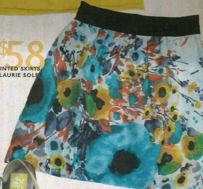
PRINTED SKIRTS FROM LAURIE SOLET