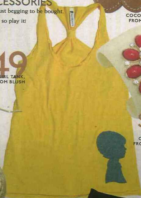
BOY MEETS GIRL TANK, FROM BLUSH