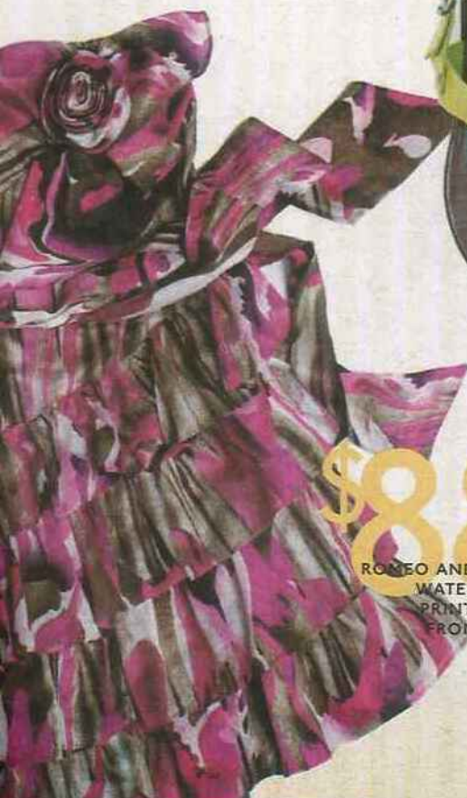
ROMEO AND JULIET WATERCOLOR PRINT DRESS, FROM JECCA