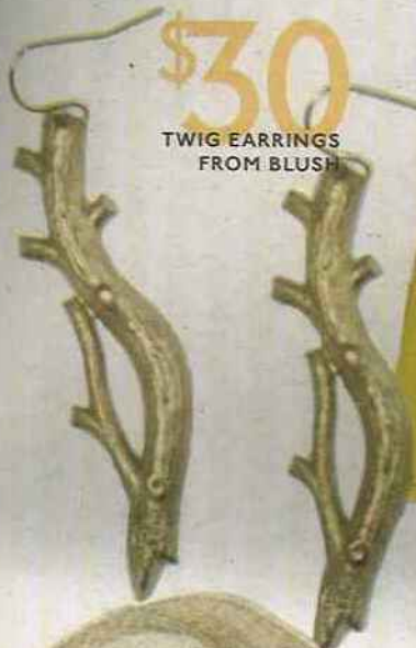
TWIG EARRINGS FROM BLUSH