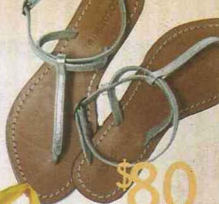
$80 COCOBELLE SANDAL, FROM DOTDOTDASH

for a fashion-minded girl is that outfits can be a whole lot less expensive than they are in winter. Is it because the clothing is smaller? If only it worked that way! Local boutiques know we've tightened our figurative belts but that we still want what's new. They've filled their stores with BREEZY DRESSES , SASSY SANDALS and COLORFUL ACCESSORIES with wallet friendly price tags, just begging to be bought. It's a NUMBERS game, so play it!