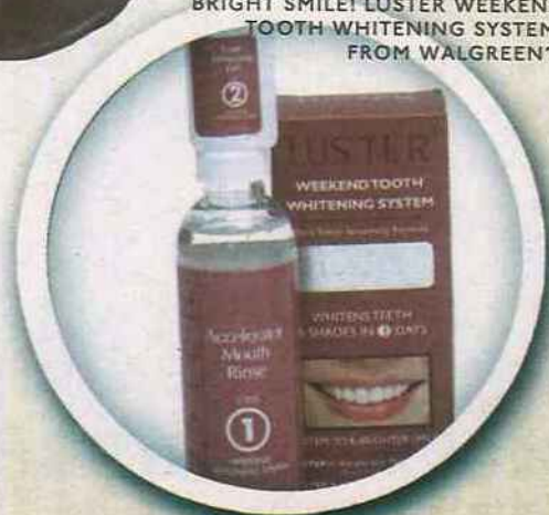
THE BEST ACCESSORY IS A BRIGHT SMILE! LUSTER WEEKEND TOOTH WHITENING SYSTEM, FROM WALGREEN'S