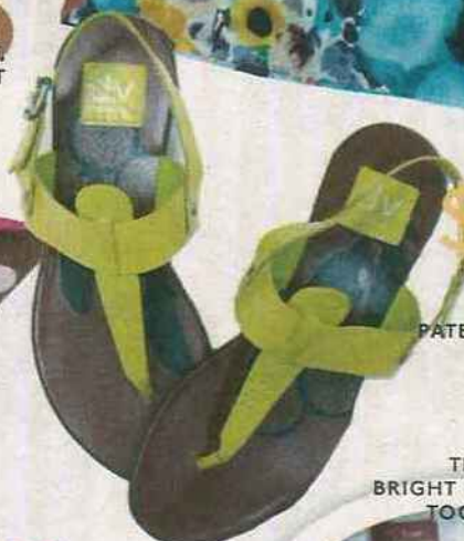
DOLCE VITA PATENT SANDALS, FROM ZIEZO