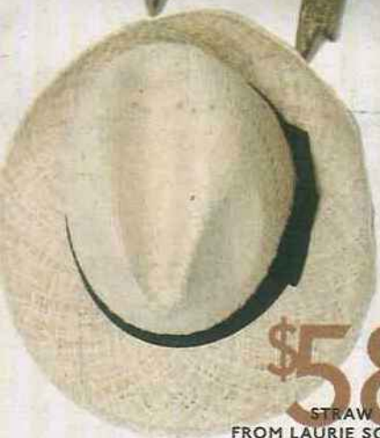
STRAW HAT, FROM LAURIE SOLET