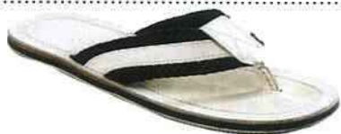
DOLCE & GABBANA LEATHER THONGS AT SAKS FIFTH AVENUE STORES NATIONWIDE: $335.