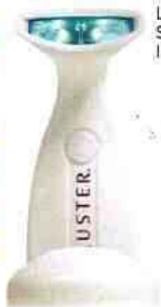
LUSTER WEEKEND TOOTH WHITENING SYSTEM AT LUSTERPREMIUMWHITENING.COM: $20