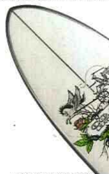
COACH "TATTOO" SURFBOARD AT COACH.COM: $1,500