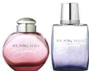
BURBERRY SUMMER FRAGRANCES AT BETTER DEPARTMENT STORES NATIONWIDE $57 - $63