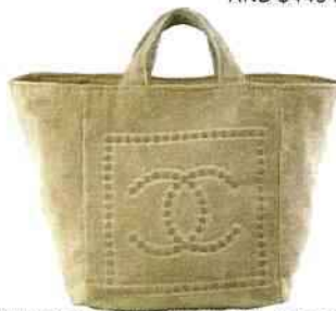
CHANEL TERRYCLOTH TOTE AT SELECT CHANEL BOUTIQUES: $990